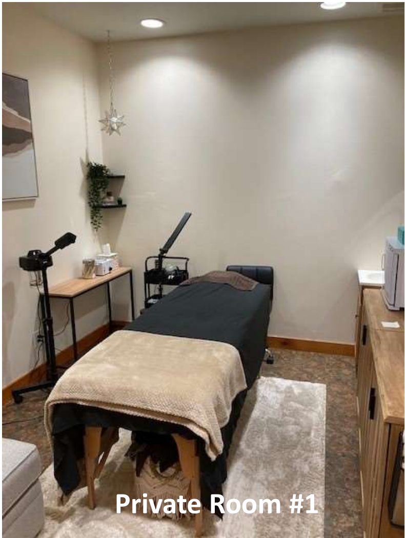
Private Room #1